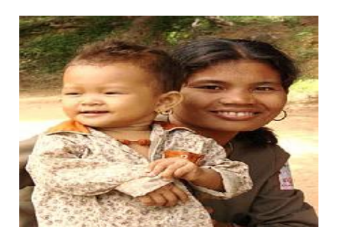
Figure 2: Mother and Child in Cambodia

A mother's love should never need to be earned by the child. The child should warrant the same without any restrictions. However, if this is not so, the child will experience a void in its heart all of their life. A mother's love should be unconditional, thereby laying the foundation of trust and emotional intimacy. If love is withheld, a child will search for it in million other ways, sometimes throughout their lifetime unless they come to some sort of peace with their past. The emotional foundation we bequeath our children at home helps establish their life. Therefore, the significance of home and the power of mother's love should always be valued.