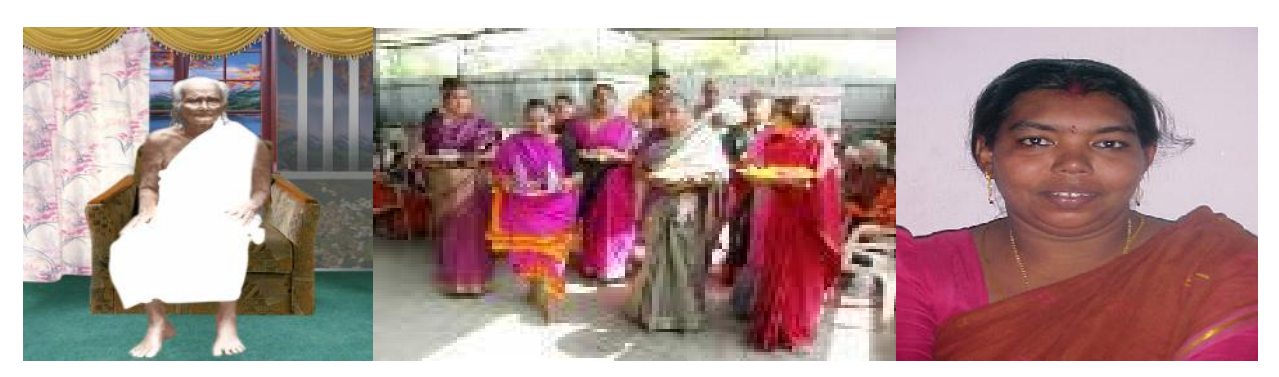
Figure 8: Mothers

Empowerment is the only way to enable our mothers to improve their position and better control their resources and bring change in the age-old ideas. Empowerment is a multidimensional process facilitating individuals and or a group of individuals to appreciate their full potential in all aspects of life. Caught in the changing scenario of globalization, the time to question whether the trend of feminism will hold or not <sup>23</sup>. Are mothers moving toward empowerment or are becoming trapped in a wider web? However, some important factors that account for evaluating mothers' empowerment are male-to-female ratio, literacy, population of women, age of marriage, mothers' health status, and so on.